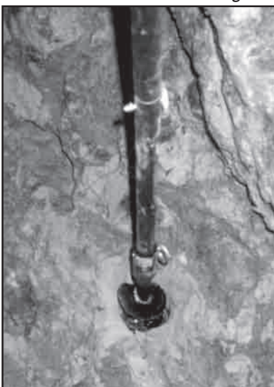
Drill On! The two foot long bit has fully penetrated the rock.