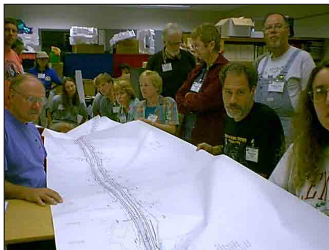
CAVE POLLUTION: A detailed map of spill retention and runoff filtration structures along Interstate 65 near Mammoth Cave National Park is shown to participants at the 2001 Cave Conservation and Management Section meeting in Kentucky.

Information on clearinghouses for data on international cave and bat conservation was pre-